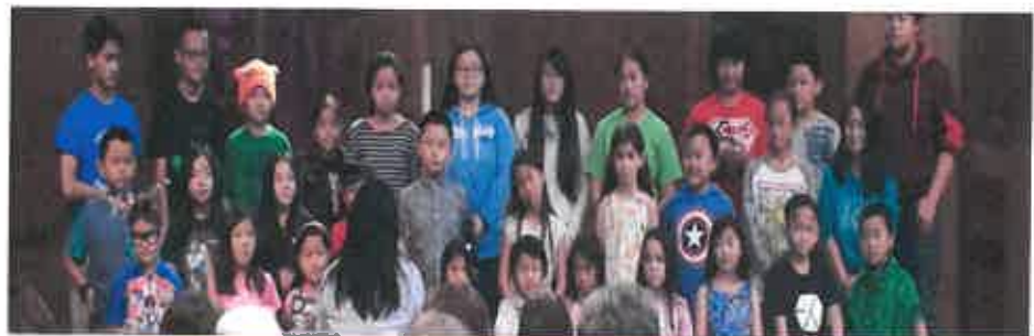
HMong Students Singing for CNH LWML Zone 3 Rally at St. Paul